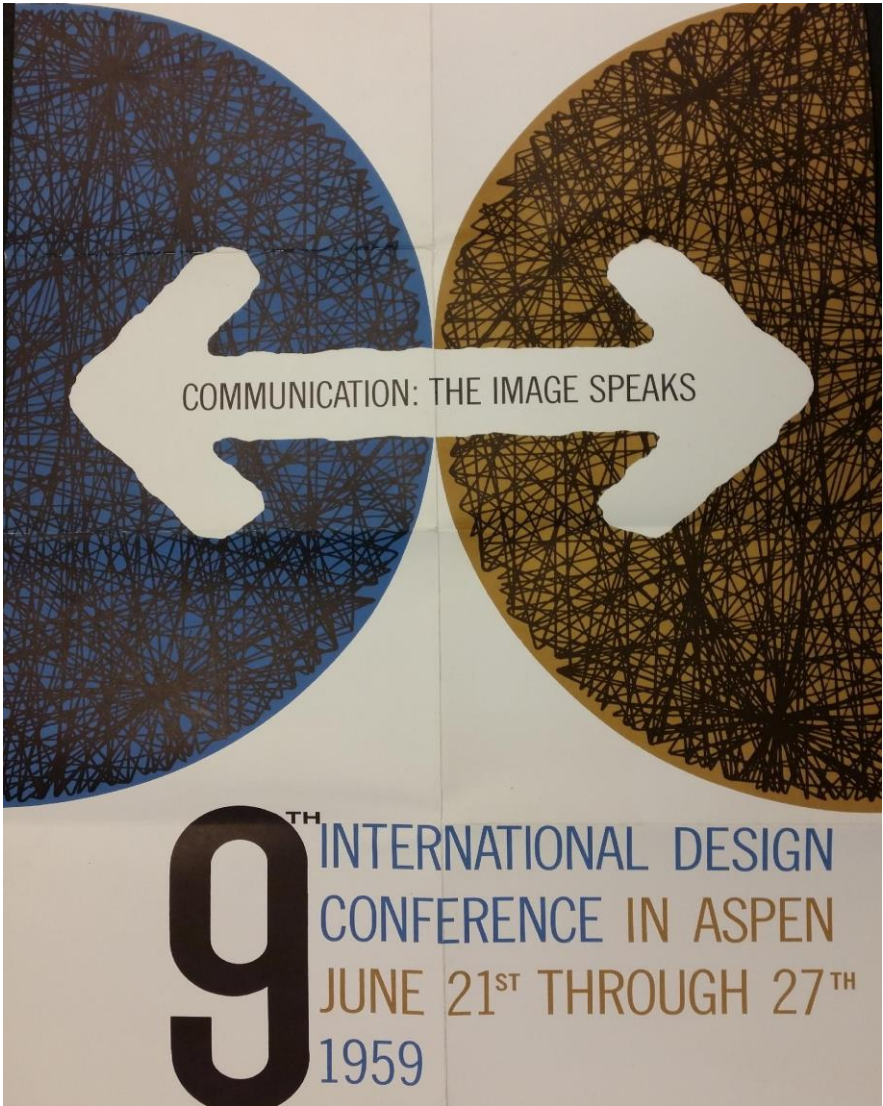
Figure 3. Poster of the IDCA 1959 (source: private archive).

designers to take responsibility, that is, to be members of mankind and to fully understand what their “membership” meant: (...) what has been lost is the fact and the ethos of man as craftsman” (IDCA Records, 1958). Man and ethics were the new issues at the top of the design agenda; a similar mindset was spreading also on the other side of the ocean, where the debate started focusing more and more upon design’s moral and political values, including in teaching (Stile Industria, 1959).