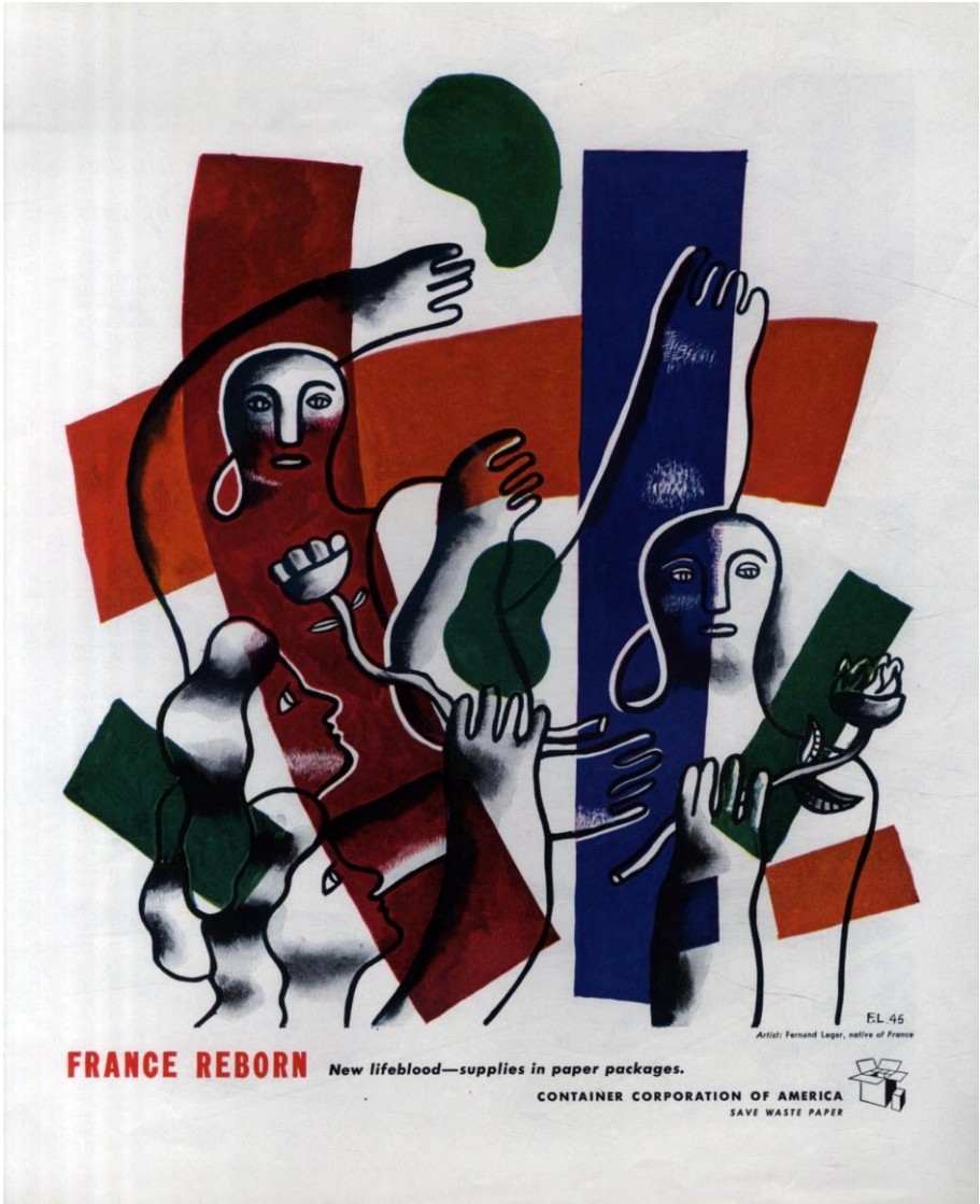
Figure 1. Magazine page designed by Fernand Léger for Walter Paepcke's Container Corporation of America. For Paepcke, visual arts and graphic design were crucial tools for improving business well before the inception of the IDCA.

suggest that the presence of industrialists was not that essential for the real objectives of the IDCA.