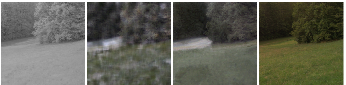
Figure 4. Colorized validation_0016 . Left to right: NIR image, CNN, NIR-GNN, RGB ground truth.