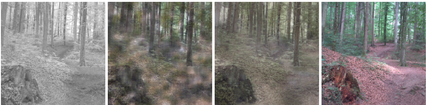
Figure 3. Colorized validation_0013 . Left to right: NIR image, CNN, NIR-GNN, RGB ground truth.