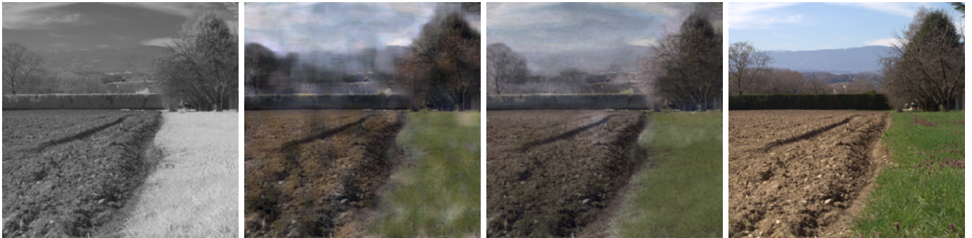
Figure 2. Colorized validation_0004 . Left to right: NIR image, CNN, NIR-GNN, RGB ground truth.