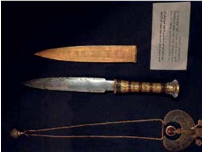
Fig. 3. Tutankhamun's iron dagger blade and sheath. Cairo Egyptian Museum.

We now know, with a very high degree of confidence, that Tutankhamun's iron dagger blade was made of meteoritic iron. It appears that ancient Egyptians were well aware of iron falling from the sky. Quoting from George Frederik Zimmer, The Antiquity of Iron (1915): "The most ancient name for iron was 'Metal from Heaven'. In the hieroglyphic language, it was pronounced BA-EN-PET, meaning either stone or metal from Heaven. A basic Egyptian idea, expressed in ancient Egyptian texts, was that the firmament of Heaven was made of iron. This belief probably arose from iron's blue color and from the occasional fall of meteoritic iron from the sky". But the importance of iron in ancient Egypt was not only limited to references in religious texts. Referring again to Zimmer (1915), one of the Pharaoh's of the I Dynasty was known by the name MER-BA-PEN, literally, Lover of this iron . A Pharaoh would not bear that name if the Egyptians of the I Dynasty had not known iron.