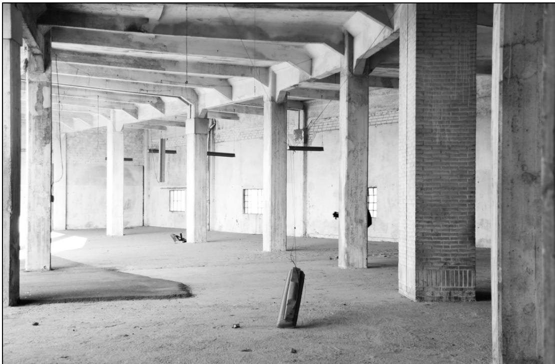
Fig. 4 Mercado de Legazpi in 2015. Detail of the structure on the first floor of the building.

compares their design with that of an operating theatre. The careful design of the new models of the Plan de Mercados influenced the subsequent public architecture and placed Madrid in the scenario of the Modern Movement. A new demographic increase in the sixties led the municipality to take new measures, which in 1973 merged with the Mercamadrid company, with which the commercial functions of the city were relocated, determining the end of the large markets of the early twentieth century. Analyzing the evolution of Spanish and, above all, Madrilenian architecture in the 20th century is a necessary process for understanding the evolution of the Mercado de Legazpi , which today remains the emblem of Madrilenian rationalism and is one of the first examples in Madrid of large reinforced concrete buildings. It is spread over a space of about 30,000 square meters within the lot to which it belongs, from which it takes over the triangular shape. The building is developed on two levels, with the exception of the two buildings adjacent to the Plaza Legazpi which delimit a smaller courtyard, and which was the