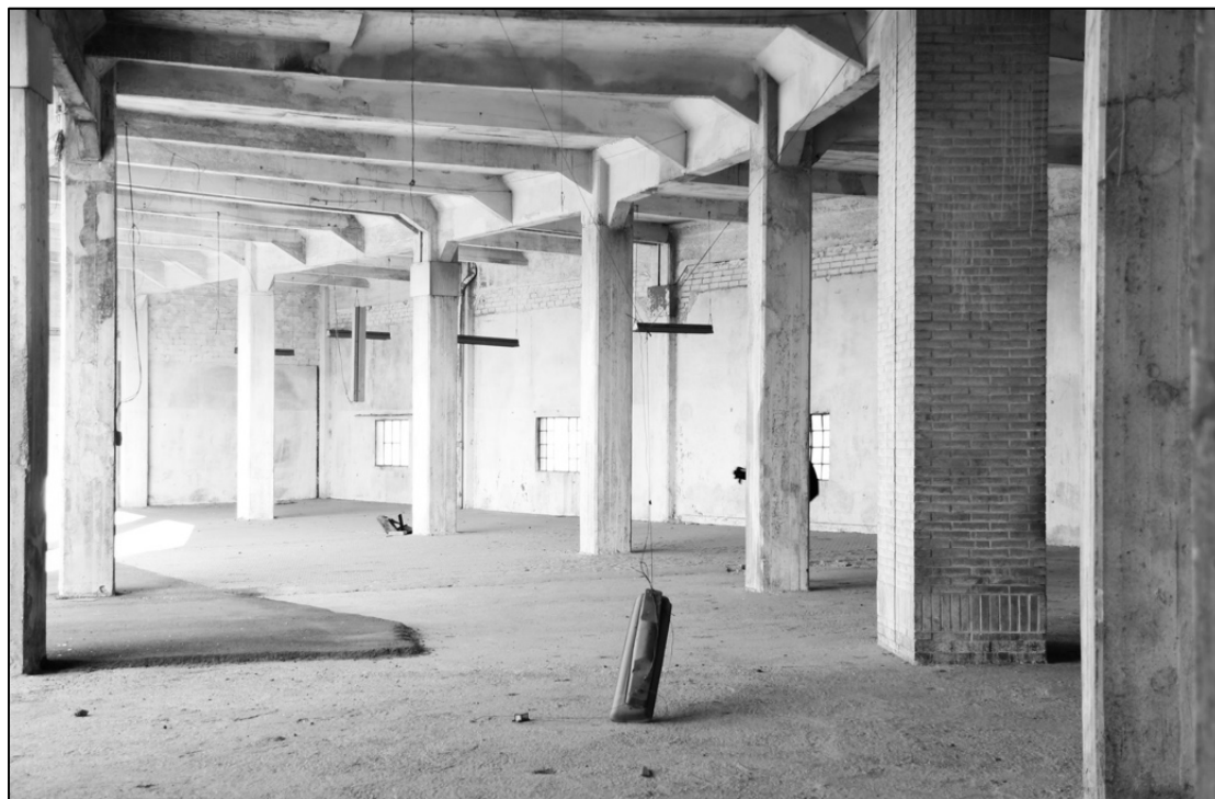
Fig. 4 Mercado de Legazpi in 2015. Detail of the structure on the first floor of the building.

compares their design with that of an operating theatre. The careful design of the new models of the Plan de Mercados influenced the subsequent public architecture and placed Madrid in the scenario of the Modern Movement. A new demographic increase in the sixties led the municipality to take new measures, which in 1973 merged with the Mercamadrid company, with which the commercial functions of the city were relocated, determining the end of the large markets of the early twentieth century. Analyzing the evolution of Spanish and, above all, Madrilenian architecture in the 20th century is a necessary process for understanding the evolution of the Mercado de Legazpi , which today remains the emblem of Madrilenian rationalism and is one of the first examples in Madrid of large reinforced concrete buildings. It is spread over a space of about 30,000 square meters within the lot to which it belongs, from which it takes over the triangular shape. The building is developed on two levels, with the exception of the two buildings adjacent to the Plaza Legazpi which delimit a smaller courtyard, and which was the