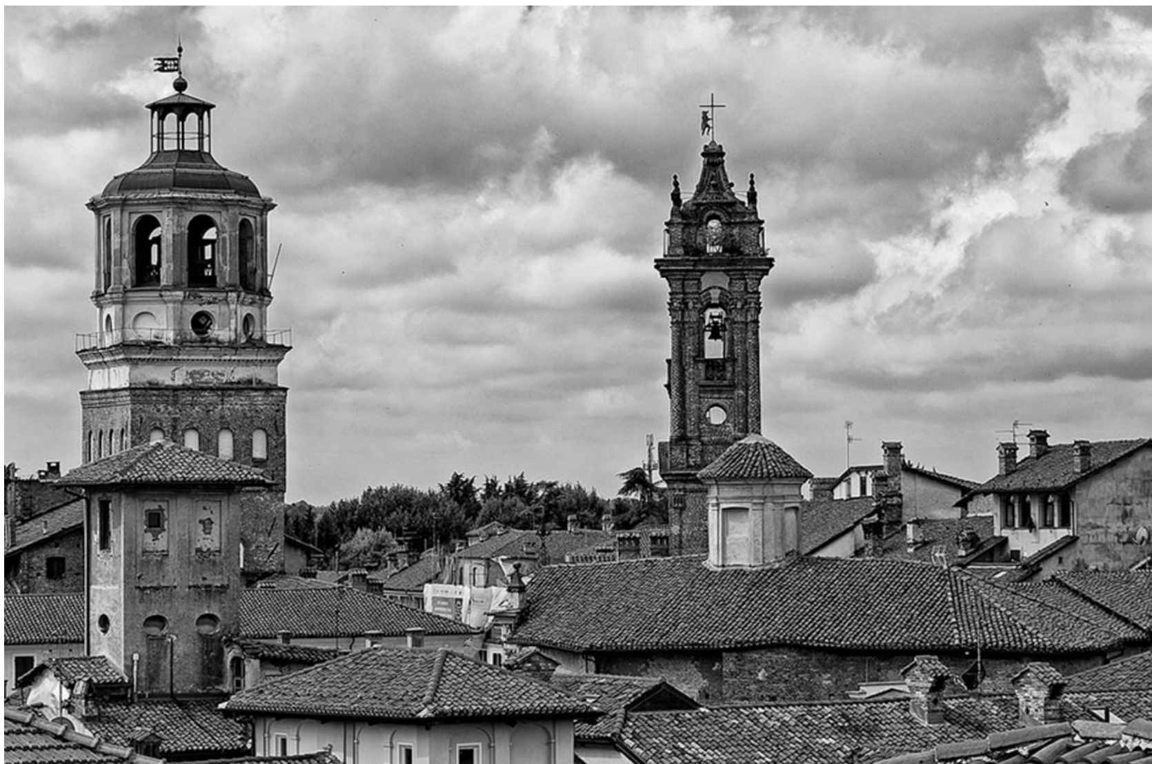
Fig. 6: Panoramic view of the historical centre of Savigliano with the civic tower in the piazza Santarosa (photo by the author).