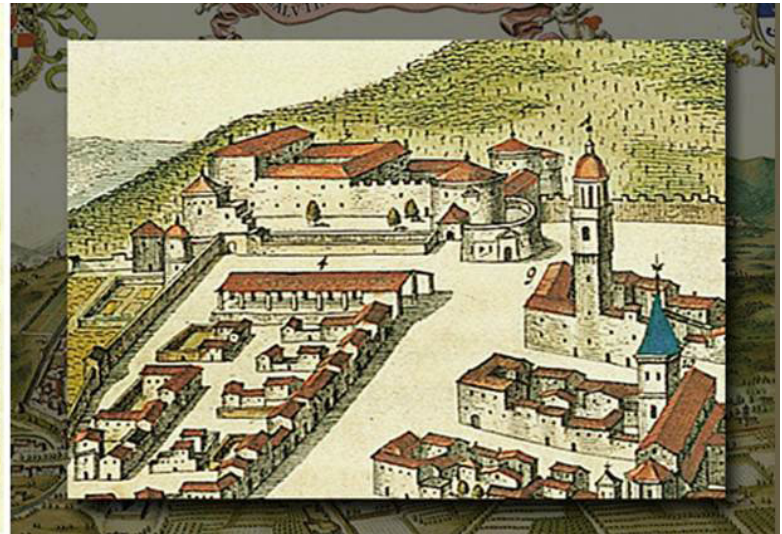
Fig. 9: Salutiarum - Civitas vulgo Saluzzo , view on the left and detail on the right in Theatrum Sabaudiae , 1725 (1682, first edition).