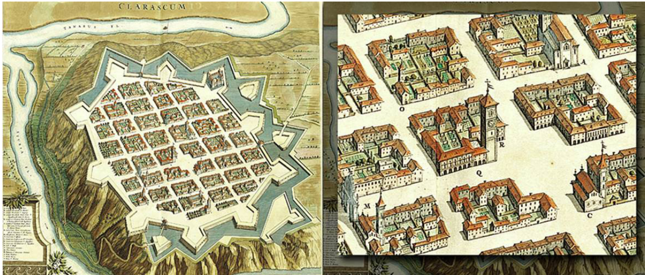
Fig. 7: Joan Blaeu, Clarascum , view on the left and detail on the right of Cherasco, in Theatrum Sabaudiae , 1725 (1682, first edition).