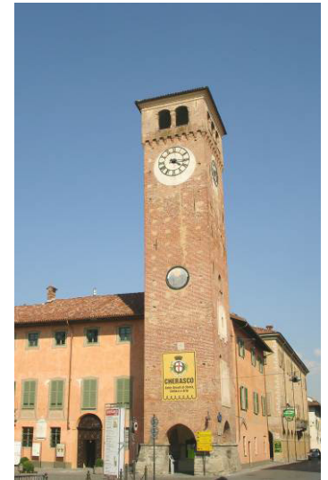
Fig. 8: Cherasco, civic tower.