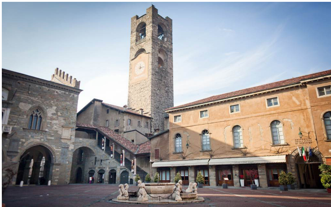
Fig. 2: Bergamo Alta (upper city), Piazza Vecchia with the civic tower between the Palazzo della Ragione and that of the chief magistrate.

In the Po Valley the oldest municipal buildings favour a model that provides a large open space with a loggia, freely accessible to citizens, where commercial activities, city assemblies and justice take place. The upper floor above the loggia is used for consul or chief magistrate meetings. If a compact parallelepiped block scheme prevails in the Lombardy area, divided into two or three floors above ground with large multi-mullioned windows, it is certainly not a single solution. This scheme is applied in Piedmont in the oldest phase of the Broletto of Novara and also in the original parts of the palatium vetus of Alessandria. The tower supports the complex, and its height symbolizes its dominion over the city [Tosco 2000].