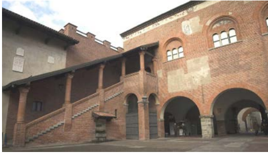
Fig. 5: Novara, the municipal palace or Broletto.

symbol of the municipality, so much so that it was reported on the frontispiece of the Ordinati comunali (minutes of the City Council meetings). The bell tolling marked the rhythms of the community: the clock struck the hours; the study bell announced university lessons; the large bell started the guards' shifts, summoned the councillors to meetings, announced bad weather and concluded the day.