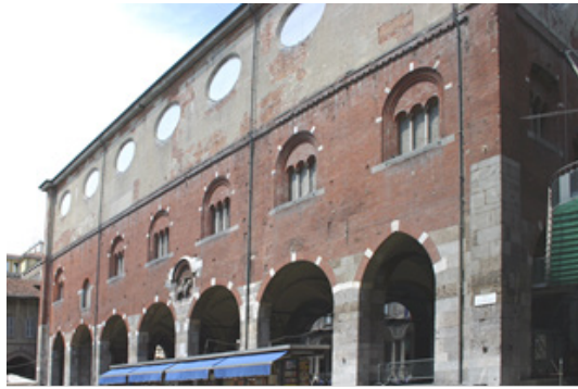
Fig. 3: Milan, the municipal palace, Palazzo della Ragione or Broletto in the Piazza dei mercanti.