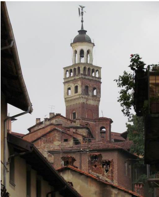
Fig. 10-11: Saluzzo, civic tower with municipal palace in Salita al castello (photo by the author).

in the final quarter of the 13th century, and these seem to suggest a plan for the expansion of the seats of communal power [Longhi 2010; Longhi 2011; Bonardi 2003]. Following are two case studies, of Savigliano and Cherasco, which still conserve their civic towers. The domus comunis of Savigliano has the oldest documentary attestation in south-western Piedmont, since 1224. Only in 1319 did the term palacium curie appear, currently used to indicate the seat of civic power. During the Angevin dominion, the palace remained the main place of civil power [Garzino, Olmo 1987]. The building is on the road intersection that joins the platea – central market area of the city – with the Sant'Andrea parish, ecclesiastical pole of the settlement expansion of the communal age. In the first two decades of the 13th century the platea was already established as a reference point for the municipality, which had convened its meetings in the church of Sant'Andrea (1205) and in the market (1217). The area in front of the town hall required a larger opening towards the platea , progressively saturated by the expansions of the housing complex of the Galatari family.