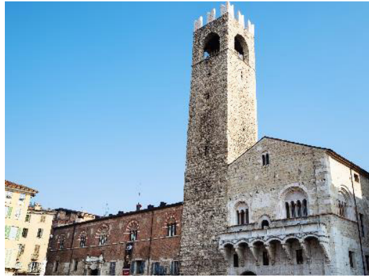
Fig. 4: Brescia, old town hall Broletto, Torre del Pegol, Loggia delle Grida in the piazza del Duomo or Paolo VI.

tower, the Poncarali, was incorporated into the structure. In 1236, the new militum cast bronze bell by Bartolomeo Pisano was positioned on the Torre del Popolo [Volta 1987; Andenna 1994; Coccoli, Scala, Treccani 2009; Rossi 2009; Rapaggi 2012].