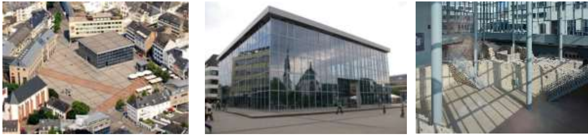
Fig. 8: Viehmarktplatz in Trier (Germany)

Given that in many cases the lack of funds generates precarious projects without the necessary technical and formal care, this more affects the sites in suburban contexts. In fact, the "musealization" of multi-layered urban sites has not the only purpose of protecting remains but it must reconcile many functional needs, safeguarding the remains but also ensuring the communication of their meanings and their relationship with the present city. In this case museography in turn contaminates itself with urban architecture, but must leave such signs that they are not only noticed but also understood by people.