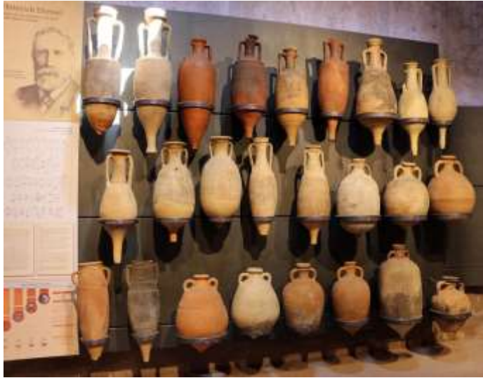
Fig. 3 (left): Display of amphorae studied by H. Dressel, recently restored, at the Mercati di Traiano Museo dei Fori Imperiali in Rome (Italy)