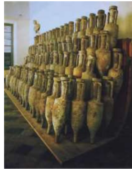
Fig. 3 (left): Display of amphorae studied by H. Dressel, recently restored, at the Mercati di Traiano Museo dei Fori Imperiali in Rome (Italy)