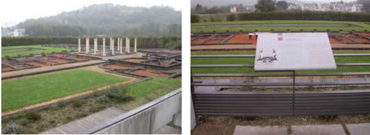
Fig. 10: Archeological site of Echternach (Luxembourg)

The accessibility of this heritage, both physical and cultural, is nevertheless much more difficult to achieve, because the remains are fragmented and the terrain uneven, and because their silence must be filled with many contents. Archaeologists, who are familiar with histories and hypotheses of such sites, rarely find valid help in a truly museographic design approach: that is, appropriate to protect and preserve them but at the same time to enhance and make them more decodable.