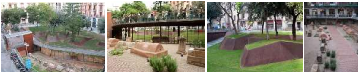
Fig. 9: Villa de Madrid Square, Barcelona (Spain)

As far as extra-urban archaeological sites are concerned, the conservation and enhancement requirements usually prevail since there is no need to take into account the complex requirements of urban life, which often overwhelm archaeological interest the chance to carry out more far-reaching interventions.