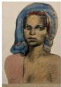
Design by Le Corbusier 1931