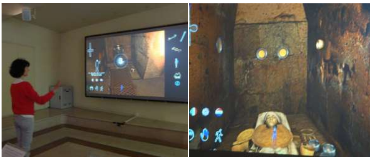
Fig. 12: Virtual reality experimentation at Musei Vaticani on an Etruscan tomb (V-MUST.NET European project)

These technologies are also very effective in reconnecting archaeological sites to objects preserved in museums. The sites deprived of movable objects, for conservation reasons, are silent witnesses of a culture of the past that only thanks to technology can return to shape a unified frame. Furthermore, the mediation of contents through ICT is a means to limit the anthropic impact on the sites (and therefore promoting their conservation) at the same time guaranteeing the fruition even in conditions where the site cannot be visited