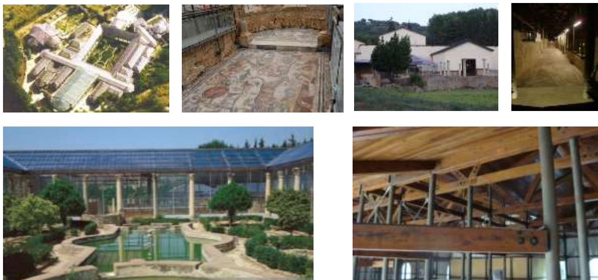
Fig. 11: Villa del Casale, Piazza Armerina (Sicily): on the left, the solution of Franco Minissi, evoking the ancient Villa, protecting mosaics, allowing an involving visit; on the right, the current situation, the current situation, following Guido Meli's project

Of course, the approach of the intervention is also proportionate to the value of the site: from this point of view Franco Minissi's intervention in the Roman villa of Piazza Armerina, in Sicily, still represents a reference of fundamental importance. In the transparent roof the visitor could recognize the ghost of the ruined villa, and he or her finally was able to interpret its external and internal spaces, while the exceptional mosaic floors were actually protected and daylight could illuminate them enhancing their colours. The large complex was certainly impressive, but in a strange way it could not be defined as invasive.