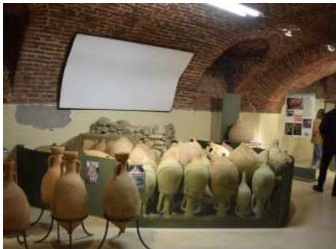
Fig. 7: Display of re-used amphorae at the MAC in Chieri (Italy)

See also the case of Chieri's MAC (fig. 7), a small exhibition space, curated in 2009 by the Soprintendenza per i Beni Archeologici del Piemonte e del Museo Antichità Egizie [5], aiming to balance communicative needs without sacrificing the richness of the archaeological content, rather exalting it. Here it is evident how the knowledge of the archaeologist was put at the service of communication, renouncing the use of technical and specialized details large inaccessible to a wide audience. The experience of fruition is focused on organizing a story around the life of the object (amphora), which although created for a specific purpose (container to transport) had a second life as a recycled object (it was in fact reused for the drainage of the ground but also as a cinerary urn): in this case, an archaeological object represents for the public something unexpectedly topical.