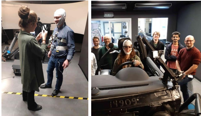
Fig. 4. The final Application Experiment on the Dynamic Vehicle Simulator at AVL

The algorithm, in these cases, can predict the falling asleep phase with an average of almost 3-4 minutes.