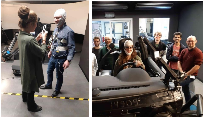
Fig. 4. The final Application Experiment on the Dynamic Vehicle Simulator at AVL

The algorithm, in these cases, can predict the falling asleep phase with an average of almost 3-4 minutes.