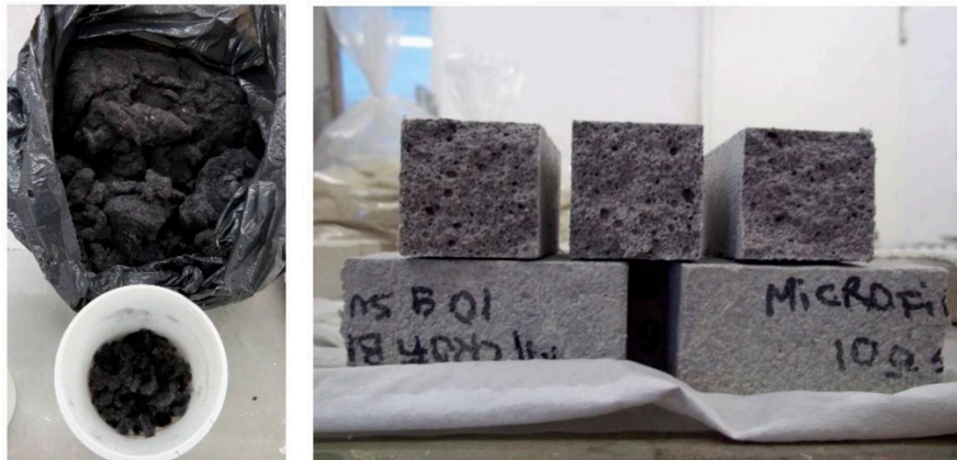
Figure 3. ReCash Plaster (Recycled Cashmere for Plaster): from textile waste to experimental specimens. On the left, wool and cashmere dust; on the right, pre-mixed plaster obtained by replacing glass fibres with textile waste.

waste. The first scenario involves the plaster manufacturer, which would have to invest in a machine for the industrialised dispersion of the fibres in the mixture, which was carried out manually during the experimental phase. The second scenario involves the addition of an element to the supply chain between the company supplying the waste and the company producing the plasters: a third company capable of taking the waste and processing it for subsequent economic exploitation as a new resource. Each of these scenarios presents strengths and weaknesses that deserve to be discussed during the industrial development phase, but each scenario is formulated to foresee economic advantages for the parties involved. In an upcycling concept, some pre-consumption textile waste can be transformed from waste into a resource and included in a new “value chain” [20].