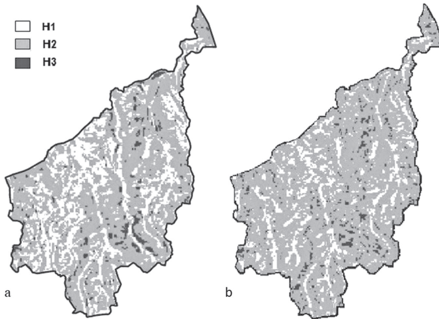
Fig. 5. Comparison between the SINMAP (a) and the QHM (b) hazard maps. Classes of hazard: very low (H1), low/moderate (H2) and high (H3).

Mappa di pericolosità da frane superficiali per il Comune di Cellio (VC) ottenute con SINMAP (a) e QHM (b). Classi di pericolosità: molto bassa (H1), bassa/media (H2) e elevata (H3).