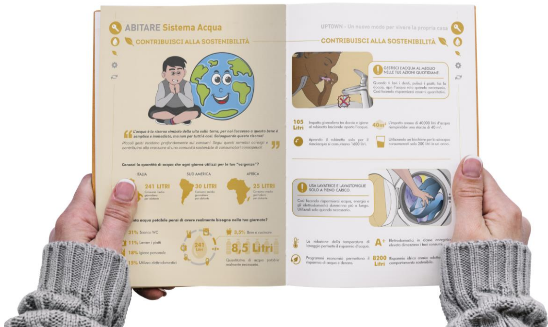
Figure 5. The pages of the Conscious Living book. In detail, an example of communicating qualitative and quantitative data to increase the user's level of awareness. On the left, Gio and Gaia, the two leading figures. (by Authors)

action. The development of guide characters designed according to the type of content that they communicate was extremely useful. Gio, a child who pays attention to environmental sustainability, explains the meaning of content and expressions that revolve around the theme of environmental sustainability today. While Gaia, planet earth, describes a series of bad everyday habits that hinder the maintenance of the ecosystems. Therefore, the project is a complete assistance path that can provide practical help even during the development of small everyday actions and during the resolution of frequent apparently complex problems, which often create doubts and uncertainties in the individual.