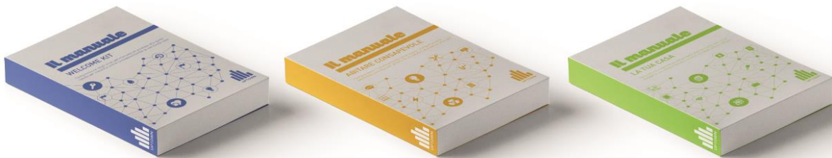
Figure 3. The three sections of the Home Handbook: Welcome Kit , Conscious Living and Your Home . (by Authors)

In its entirety, the main aim of the project is to guide the user to the spontaneous adoption of sustainable actions and behaviours, providing clear quantitative and qualitative information about the effects and benefits that can be obtained. It is important to note that each individual user will be strongly conditioned by additional factors: firstly, by their sensitivity to the subject of sustainability and current environmental and social challenges, and secondly by the possibility of tracing the behaviour suggested in others, in their neighbours, in their friends and even in the community to which they belong (Fogg, 2005). Although these factors are only partially controllable, the Home Handbook wants to convey a way of life and