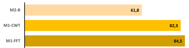
(b) LOPO validation.