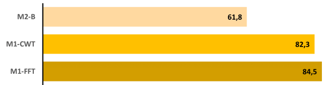
(b) LOPO validation.