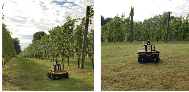
Fig. 3. Test on the relevant environment with the Clearpath Robotics, Jackal model platform.

per second by our model. In fact, the control frequency using Tensorflow with a frozen graph was 21.92Hz, whereas, with the performed optimization, we reach 47.15Hz.