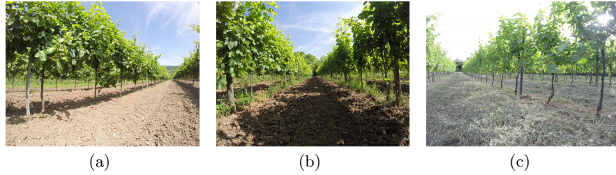
Fig. 2. Three samples of the dataset used to train the network, one for each class. Fig.2(a) is an example of the left class, Fig.2(b) of the center class, and Fig.2(c) of the right class. Dataset samples have been collected with different weather conditions and at a different time of day. The resulting heterogeneous training set is aimed at giving generality and robustness to the model.