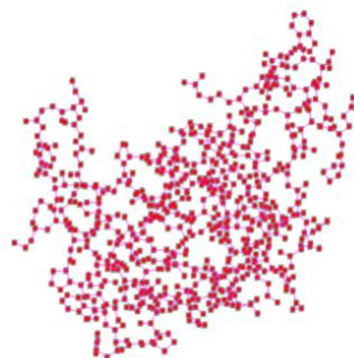
Figure 1: HIV-1 protease subunit all-atom model based on covalent bonds (AA).

As for the mechanical parameters, the entire mass of the protein (10.8 kDa \sim 1.79 \times 10^{-23} kg) was equally divided among all the atoms, whereas the average axial stiffness of the connections was set equal to 200 N/m [11,13]. Note that the numerical scaling reported in [11,13] was also used within the software environment, dealing with such small physical quantities.