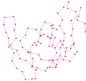
Figure 2: HIV-1 protease subunit coarse-grained model based on backbone bonds (CGB).

Consistently with the assumptions of the all-atom model recalled in Section 2.1, a coarse-grained model was developed based on C_\alpha atoms and on the protein backbone. Specifically, the coordinates of C_\alpha atoms were considered and only the connections simulating the protein backbone were generated. The resulting model geometry is shown in Fig. 2. The mass of the protein was equally divided among each C_\alpha atom and the stiffness of the backbone bonds was derived from the features of the backbone rigidity.