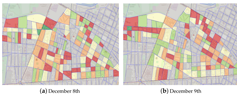
Figure 4. Average consumption per \text{m}^3 of the buildings in the monitored district, grouped by neighborhood.

The map reported in Figure 4 similarly provides the average consumption per \text{m}^3 , hence being useful to estimate the energy efficiency of the buildings. It is interesting to note that during the national holiday, even if the previously analyzed office neighborhood was green (0–20%) in total consumption (Figure 3a), it is orange (60–80%) in average consumption (Figure 4a), hence being poorly efficient when using low total energy. On the contrary, it has a very high energy efficiency on December 9th (Figure 4b) with a light-green level (20–40%), when it is a top consuming neighborhood (red level 80–100%, (Figure 3b).