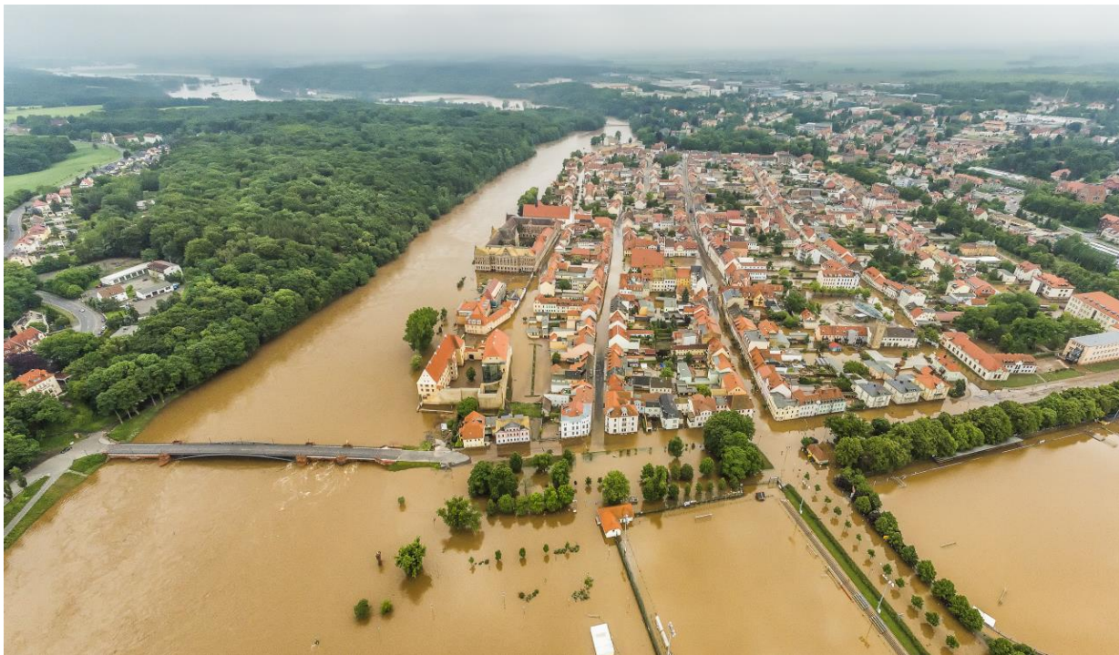
Large-scale flood in the Elbe basin, Germany, in June 2013. The City of Grimma.

Evolutionary leap in flood risk assessment methodologies is needed to reliably quantify real large-scale risk used to inform national and river basin policies worldwide.