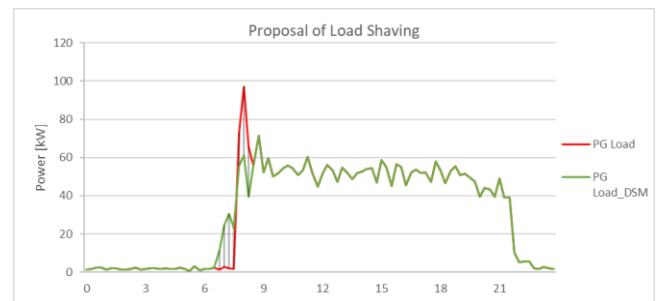
Figure 1. Possible effects of a Pre-cooling strategy applied to Polyvalent Group

The fluid distribution system of the building, considering both pumps and valves, allows to have a good control on the load in terms of flowrate requested. It could be possible both to act on the pumps of the different load utilities, controlling their operating speed and so managed flowrate, or on the load utilities valves. For the second case, the systems present a very good granularity that would allow a fine regulation of the load. For this first assessment, Figure 1 shows the expected results of the application of a supposed strategy with an observed reduction in load peak of 35 %.