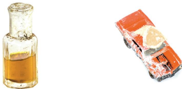
Figure 2. Objects found on the bodies of the victims.

Visitors begin the journey with an exhibition made up of photographs, videos and texts relating to the objects found on the bodies of the victims and some compasses found on boats near to Lampedusa. The objects are isolated, decontextualised and immersed in a procedural soundscape that is recomposed in real time.