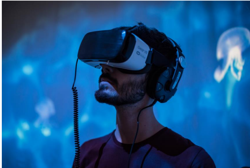
Figure 4.

Apnea documents the real. It speaks of a tragic event and a contemporary issue using interactive and immersive technologies for the purpose of raising awareness, basing its approach on generating a personal, emotional sense of involvement in each individual.