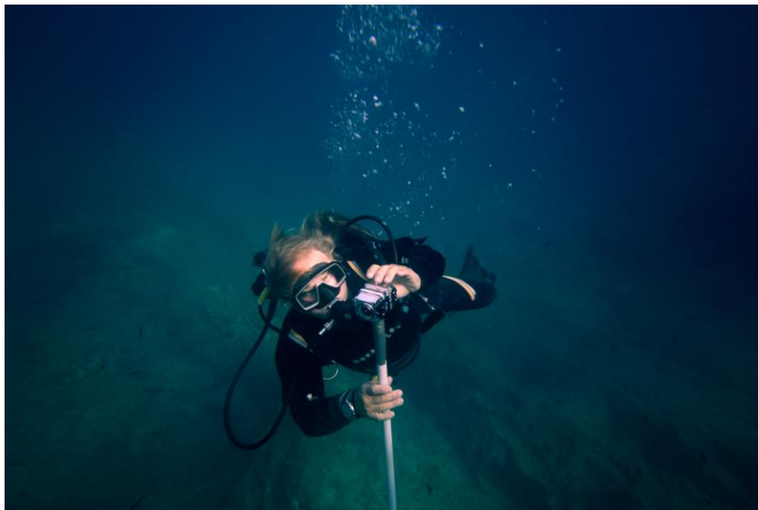
Figure 4. 360° camera in Lampedusa deep seas.