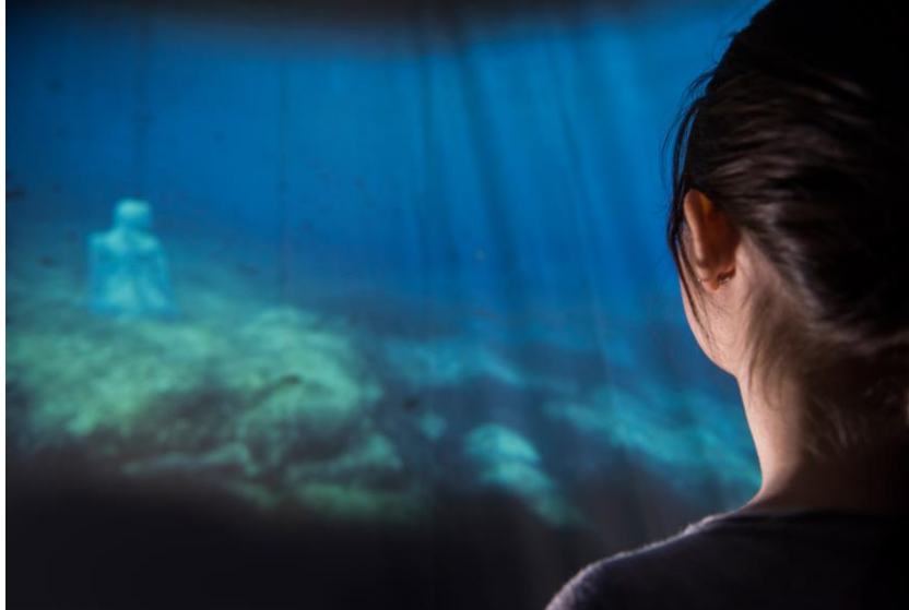
Figure 3. An interactive environment.

through an infrared camera that detects the user's presence. The user interacts with the audiovisual world through a processing data software. Jellyfishes follow the movements of the user in the room, giving a disorienting feeling of immersive slow movement. At the entrance of the room there are voices of migrants recorded live or via radio by NGOs. The situation changes when the user steps on one of the 3 text written on the floor. Each text represents a state of anguish connected with the sea: waiting, the impossibility of reaching the beach, death. Depending on the text, video projection and audio change as well.