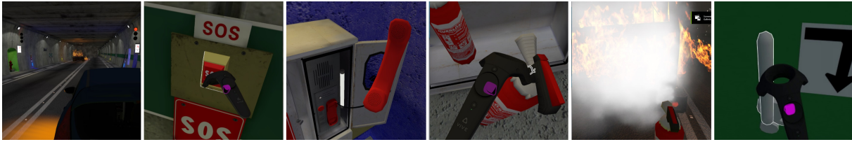
Fig. 2. FréjusVR scenario: road tunnel fire and available interactions.

strategy, different effects can be obtained. Second, it made it possible to add a mitigation for unwanted movements. In fact, the marching gesture is characterized by vertical leg movements, whereas the action of turning around is primarily composed by horizontal plane movements. Hence, user input was filtered in order to consider the sole contribution of the vertical movements, so that the user was allowed to change direction avoiding false positives at the cost of keeping the feet approximately at floor level while rotating.