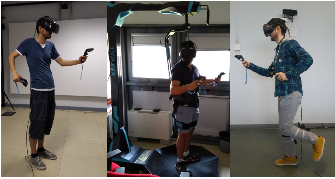
Fig. 1. Locomotion methods considered in the study: Arm Swinging, KATWalk treadmill by KATVR and Walk-in-Place.

Proxy gestures include a wide set of techniques in which the user can generate virtual motion through movements of his or her body. For instance, Arm Swinging lets the user generate a locomotion input by swinging the arms back and forth; it could be implemented with additional sensors like in [10], or exploit the hand controllers of the VR system, when available. Walk-in-Place, instead, takes advantage of two additional sensors placed on the legs of the user in order to generate movement through a walking gesture executed in place. Compared to the previous technique, Walk-in-Place leaves the user's hands free. Numerous gestures have been investigated, such as marching, wiping and tapping [11].