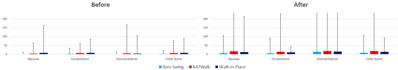
Fig. 4. SSQ scores calculated before and after the simulation, standard deviation expressed through error bars.