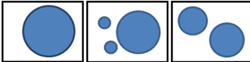
Fig.1. Three types of relationships between urban administrative unit (the black square) and urban settlement (blue circle)

However, in areas with fragmented settlements it is possible to have sub-divisional structures, with administrative representative structure (e.g. in Spain some municipalities may be divided into "Entidades singulares de población" and, in some cases, these may be governed by "Entidades locales menores"). The second category indicates those regions in which the administrative boundary contains more than one settlement, and the administrative function is allocated to the main settlement. Also in this case thresholds for the definition of the minimum size of the area may be attributed, while the status of municipality can be bestowed by a political act (e.g. Poland, Czech Republic).