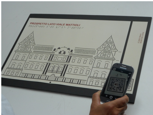
Fig. 4 Tactile table, view of viale Mattioli.

The direct ongoing discussion with the blind 5 , deemed the main bearers of interest, allowed to ascertain the efficacy of the processed material, both in terms of formal aspects and contents, and its repeatability in other sites of historical and cultural interest. The project's future developments focus on completing the knowledge pathway for the blind by creating tactile boards to be placed alongside the Italian and English captions for every room of the main floor and for the main decorative elements. At the same time the intention is to improve the informative material with videos for the deaf with subtitles and the translation in Italian Sign Language (LIS).