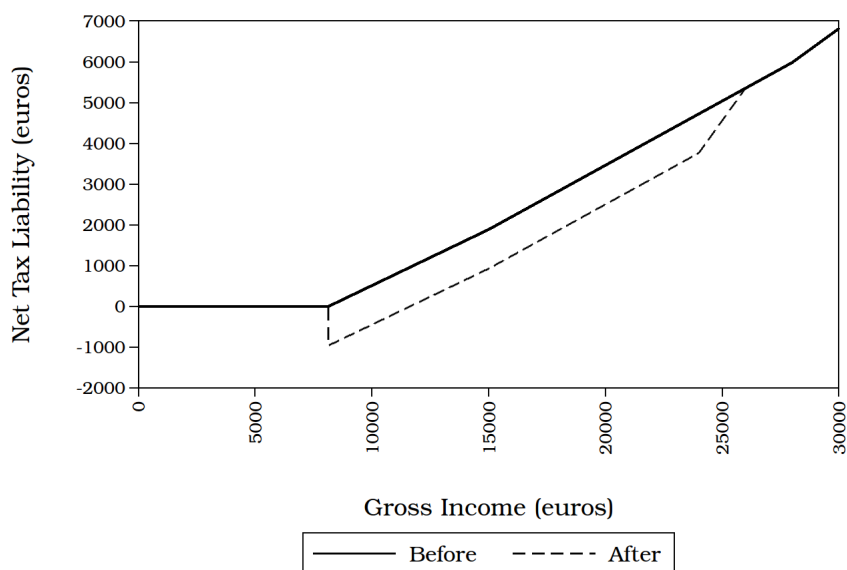
Figure 1: Net Tax Liability for an Employee

Taxpayers affected by \chi evaluate z as y - \tau + \chi , and those for whom \tau < \chi receive a subsidy. As an example, Figure 1 shows the net effect \tau - \chi for an employee without dependent individuals before and after the tax reform. Since the cash transfer decreases from 960 euros to zero in the income range 24-26 thousand euros, in this income range EMTRs increase to 80% (Figure 2).