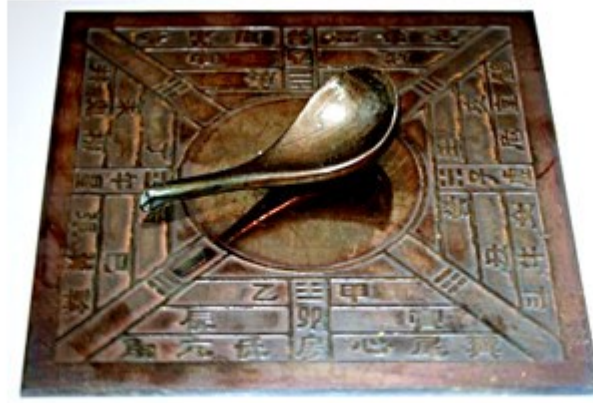
Figure 1: Model of an ancient Chinese compass having the shape of a spoon.

As explained in [11], in 1044 the Collection of the Most Important Military Techniques recorded that some magnetized fish-shaped objects were placed in a water-filled bowl, enclosed by a box, and were used to determine the direction, alongside the south-pointing chariot. However, "it was not until the time of Shen Kuo" that the earliest magnetic compasses were for navigation [11]. In his written works, Shen Kuo (1031-1095), a Han Chinese scientist and public official of the Song dynasty, made the first known explicit reference to the magnetic compass-needle and the concept of true North [11]. Actually Shen Kuo wrote, "the needle will point south but with a deviation", and also stated that "[the magnetic needles] are always displaced slightly east rather than pointing due south" [11]. Let us note that Shen Kuo was using an orientation due South, and that, since the needle was displaced slightly east, he was observing, in modern terms, a negative declination (the magnetic declination is the angle on the horizontal plane between magnetic North and true North).