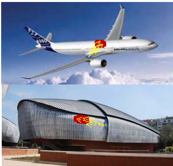
Fig.1: Examples of possible applications of a conformal RA.

In some cases, however, it would be more convenient if the antenna, instead of being planar, is able to fit a curved surface. Examples of such applications could be the case where the RA is mounted on the fuselage of an aircraft, with the feed located on a wing, or when the antenna has to be integrated in the wall of a modern building, presenting curved surfaces (see fig.1).