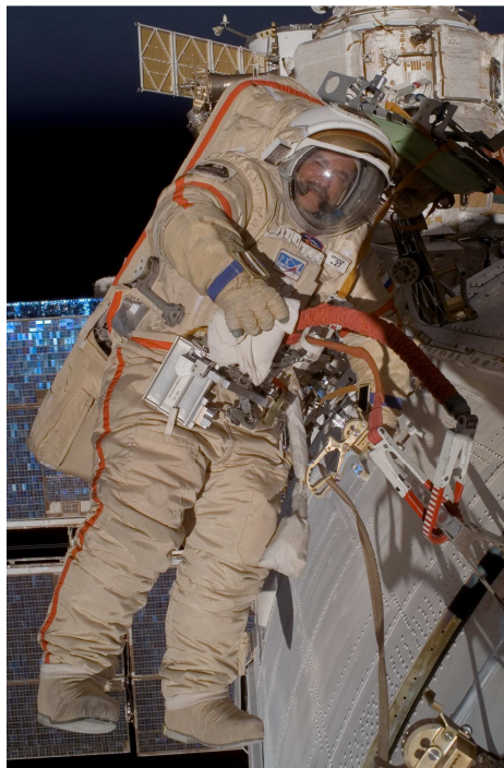
Figure 1. Orlan-M spacesuit system 10

The final variant in this series is the Orlan-M, first used at the Mir space station in 1997 (Fig. 1). The Orlan-M constituted a modest upgrade of the Orlan-DMA. The most noticeable additions were a second visor on the top of the helmet, and bearings in the upper calf area of the legs. Its slightly higher operating pressure (5.9 psi; 40.7 kPa) was not a hindrance, nor did the crew report any increase in fatigue. Crews also reported that the new Orlan-M gloves (Fig. 2) were easier to use than the Orlan-DMA gloves. 12