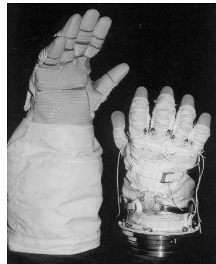
Figure 3. 4000 Series Glove Assembly 18

The next series of EVA gloves was the 5000 series. The main difference with the previous design was in the wrist joint. Although this new glove needed low torque to follow the astronaut's wrist, its steel components made it heavy in the wrist in comparison to the previous series. In this period new technologies such as Laser scanning and Stereo Lithography Apparatus (SLA) were used to some extent in developing the 5000 series. With this advancement, the reproducibility of the glove design was greatly enhanced. Later, in developing the Phase V glove these technologies were used more and more to improve the design and fabrication process; more accurate scanning was possible and data output became more readily useable by advancing computer aided design (CAD) softwares. More complex surface models were made possible as a result of 3-dimensional modeling and Non-Uniform B-Spline capabilities including in the new CAD softwares. Weight was reduced by using titanium and graphite/epoxy composite materials and