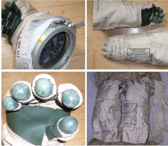
Figure 2. Orlan-M EVA Glove 11

During the evolution of U.S. EVA gloves, improvement basically focused on changing the materials, whereas the basic design of the gloves remained unchanged. This improvement started from the Mercury program and later led to the 1000 Series, the first Shuttle EVA gloves. This process continued until the Phase VI gloves when the procedure of creating the EVA gloves changed completely. These changes were basically due to the high-tech facilities that did not exist before. Stereo lithography prototyping, laser cutting and laser scanning technology, 3D computer modeling and CNC machining were all new technologies that helped designers to produce better products.