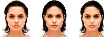
Fig. 3. Effects of symmetry: original face, left and right symmetries