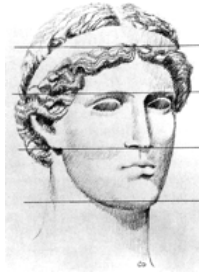
Fig. 1. Facial trisection, as originally described by Vitruvius

Classic Beauty canons. Since ancient times, the supporters of beauty as an objective and measurable property attempted to state ideal proportions, or beauty canons, for the human body and its parts. The Greek sculptor Polykleitos was the first to define aesthetics in mathematical terms in his “ Kanon ” treatise. Marcus Vitruvius, a Roman architect, introduced the idea of facial trisection, or facial thirds, largely used in medicine and anthropometry (Fig. 1).