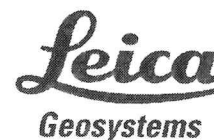
Leica Geosystems S.p.A.